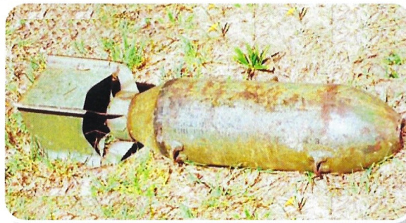
Example of a general purpose bomb

Because explosive hazards associated with military munitions from past military training may remain at the Bombing and Gunnery Range, the U.S. Army Corps of Engineers recommends that landowners and visitors follow the 3Rs of Explosives Safety – Recognize, Retreat and Report.